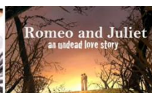
Figure 3: Waikato machinima