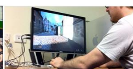
Figure 2: Massey biofeedback augmentation