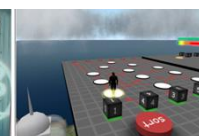
Figure 5: UoC – Unplugged activities