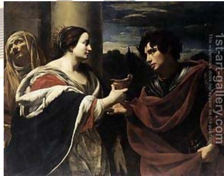
Sophonisba Receiving the Poisoned Chalice c. 1623 Simon Vouet